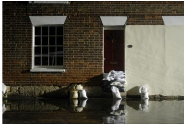
Last 3 hours